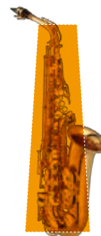
875EX Taper Shape